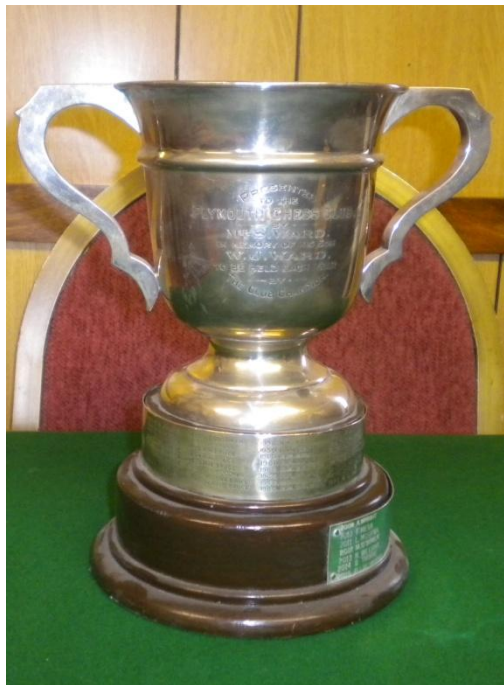
The Ward Cup – Club Championship Trophy 1931 to 1992