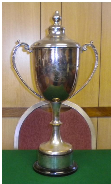
The Ron Bruce Cup – Club Championship Trophy 1993 to present